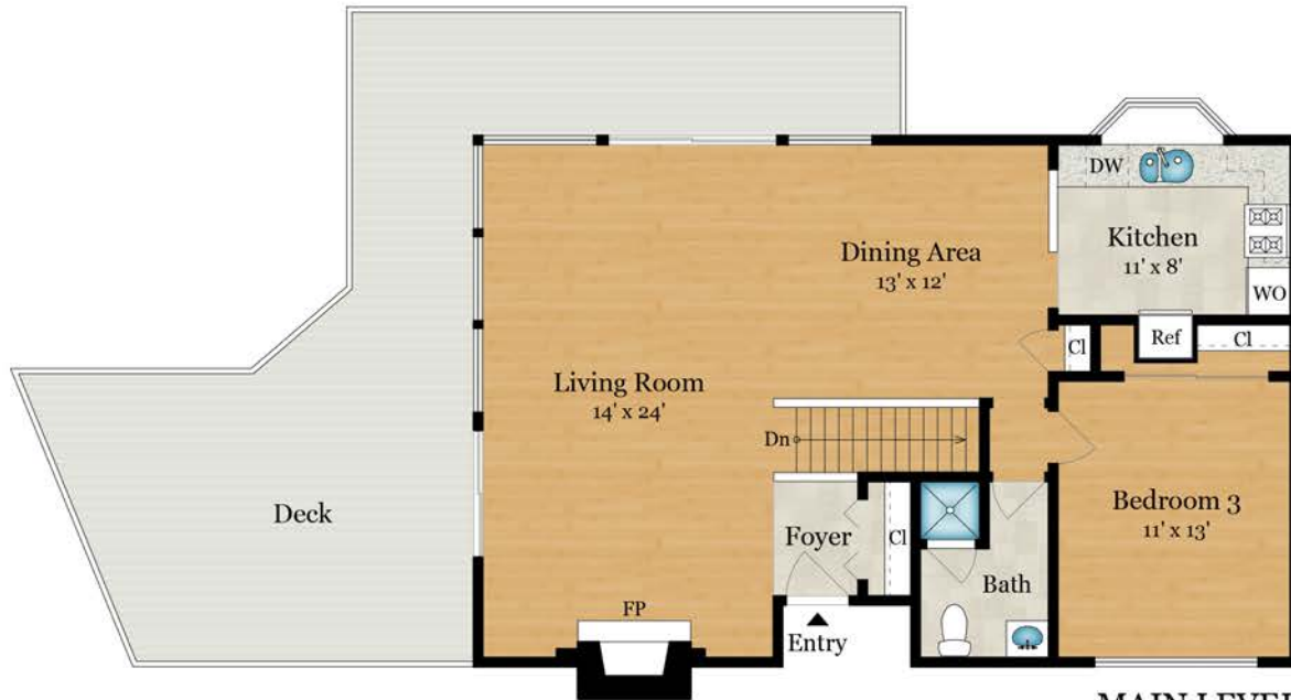
MAIN LEVEL 960 SQ FT